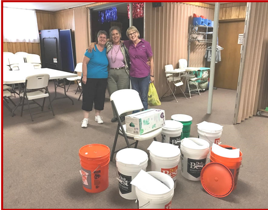
Lyndon UMC flood buckets

We are a very Missions oriented district. Thanks to all that worked hard to help reach this goal!